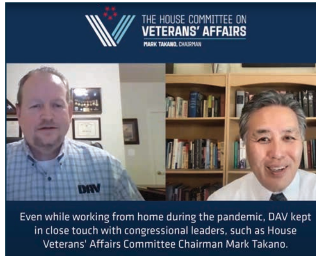
Even while working from home during the pandemic, DAV kept in close touch with congressional leaders, such as House Veterans' Affairs Committee Chairman Mark Takano.