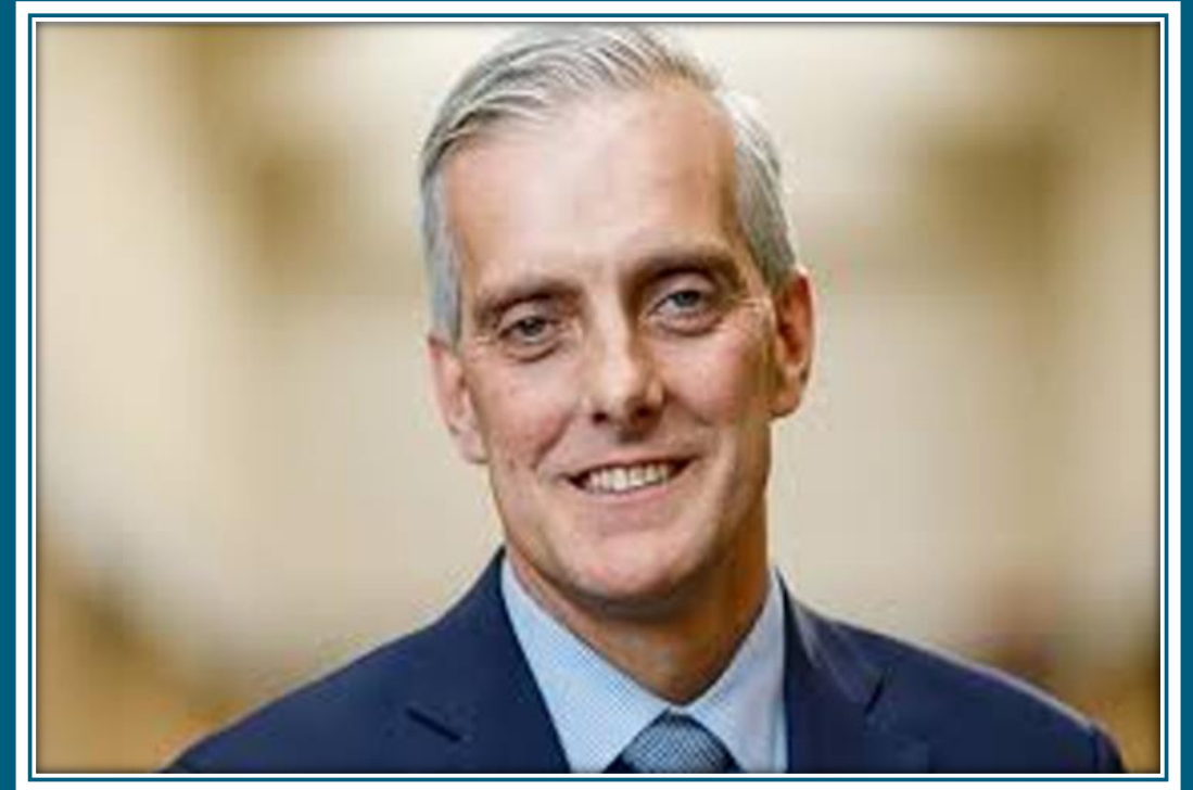
VA Secretary Denis McDonough